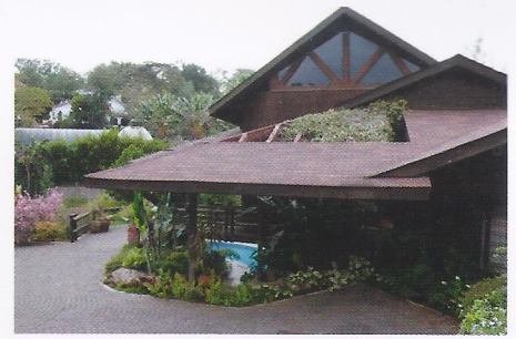
Residential Plot 7158/509

materials. It resonates with tropical house types in many African and global locations, and joins a long tradition of calm places for family life, defined by an ease with which nature and people share urban or semi-urban plots of land.'