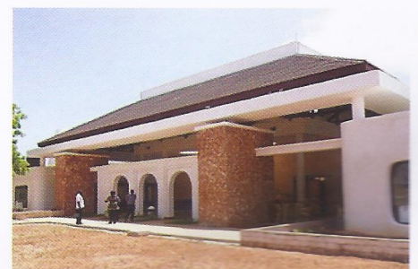
Manda Airport, Lamu

remote locations in Kenya and across the world. 'A true Place to be, while you are on your way to somewhere else.'